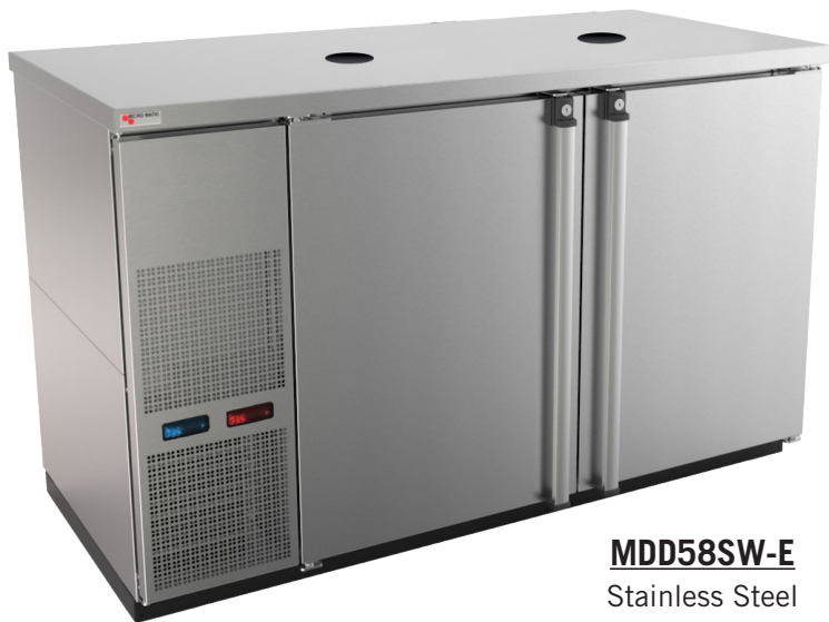
MDD58SW-E Stainless Steel